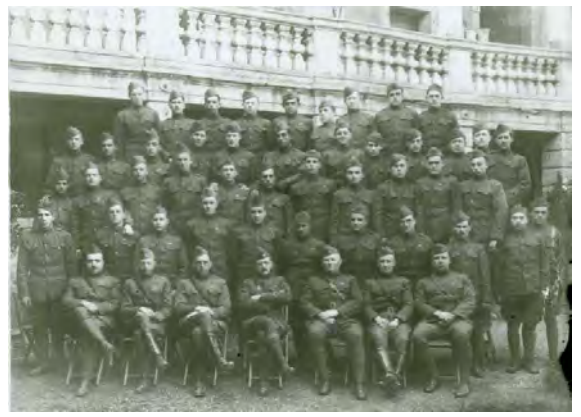
This photograph from the Moore Collection, printed from a glass negative, shows newly enlisted New Orleans soldiers.

"The First World War in New Orleans" illustrated ways in which New Orleanians contributed to the war effort. Materials came from the World War I Miscellany Collection, the Frank B. Moore Collection, the Photographs Collection, the Archives of the Orleans Parish School Board, the Sheet Music Collection, and the Rare Books Collection.