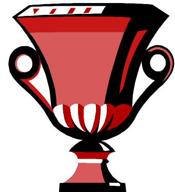
Paraprofessional of the Year